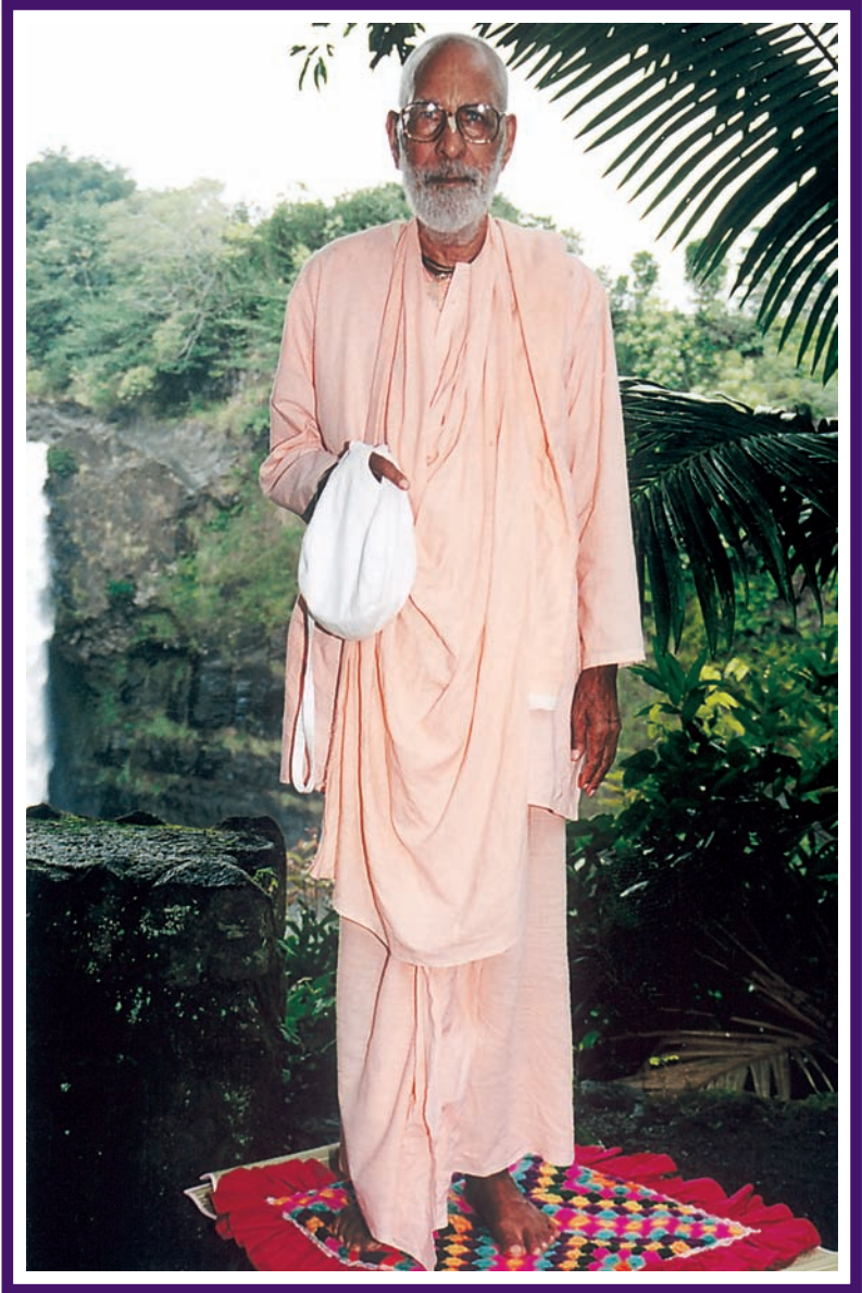
ŚRĪ ŚRĪMAD BHAKTIVEDĀNTA NĀRĀYAṆA MAHĀRĀJA