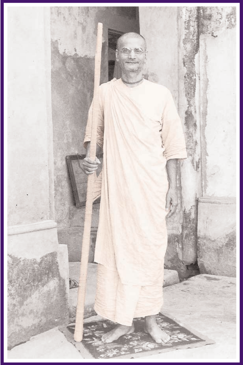
ŚRĪ ŚRĪMAD BHAKTI PRAJÑĀNA KEŚAVA GOSVĀMĪ