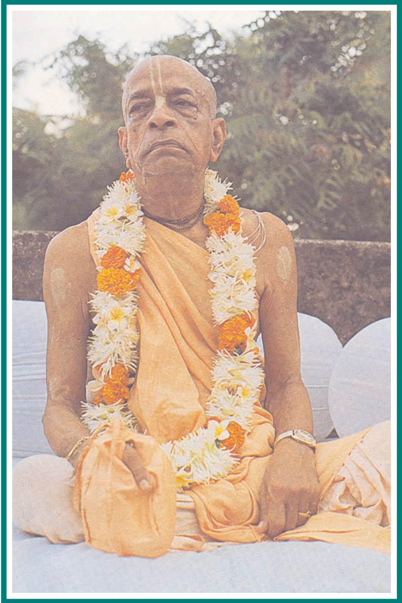
ŚRĪ ŚRĪMAD A.C. BHAKTIVEDĀNTA SWAMI PRABHUPĀDA