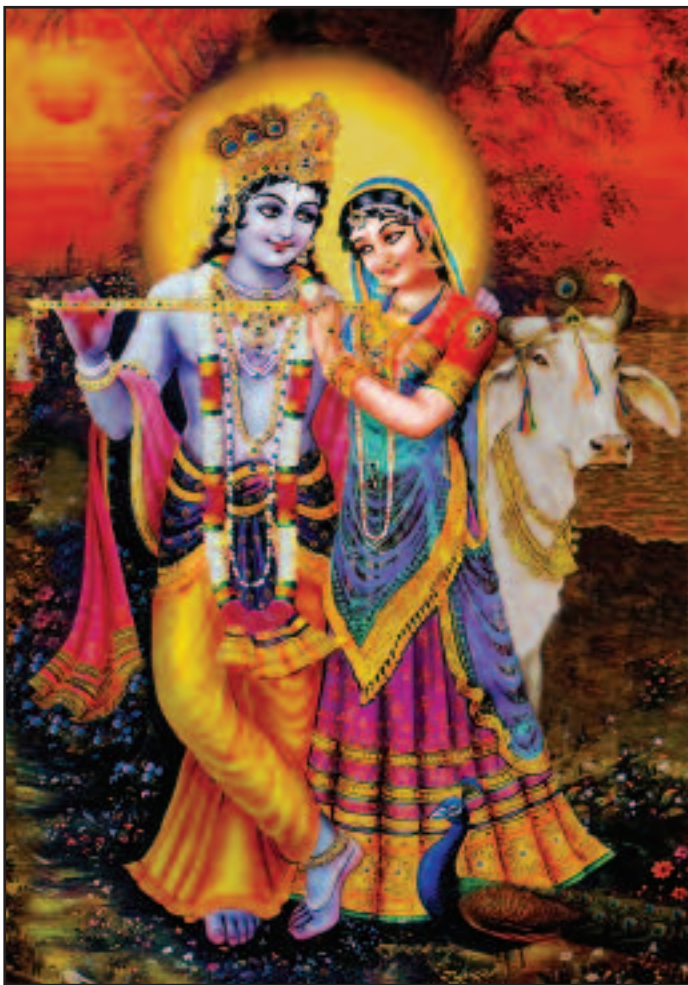
Lord Kṛṣṇa along with His eternal supreme pleasure-potency (Hare), Śrī Rādhā. He is also known as Rāma, which means the unending limit of all happiness.